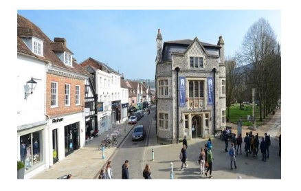
Winchester City Centre Movement and Place Plan