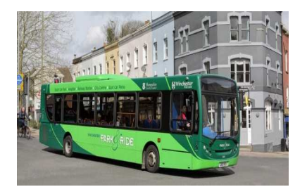
Park and Ride